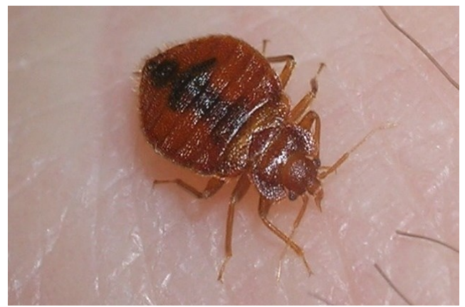
Adult bed bug feeding on blood.