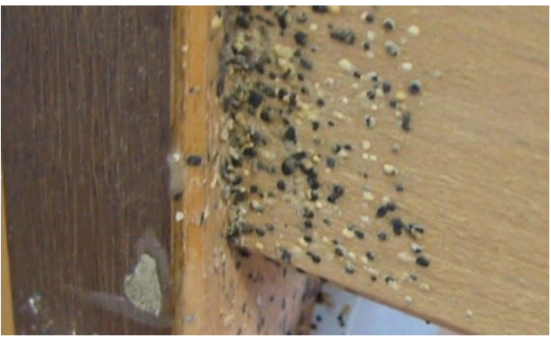
Bedbug droppings on the slats of a heavily infested bed.